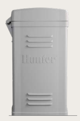
Plastic Pedestal Height: 39.5" (100 cm) Width: 23.5" (60 cm) Depth: 17" (43 cm)