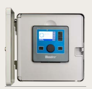
Metal Wall Mount gray or stainless Height: 15.7" (40 cm) Width: 15.7" (40 cm)

Height: 15.7" (40 cm) Width: 15.7" (40 cm) Depth: 6.8" (18 cm)